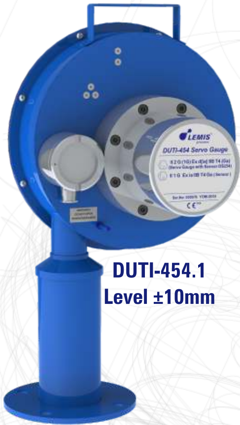
DUTI-454.1 Level ±10mm