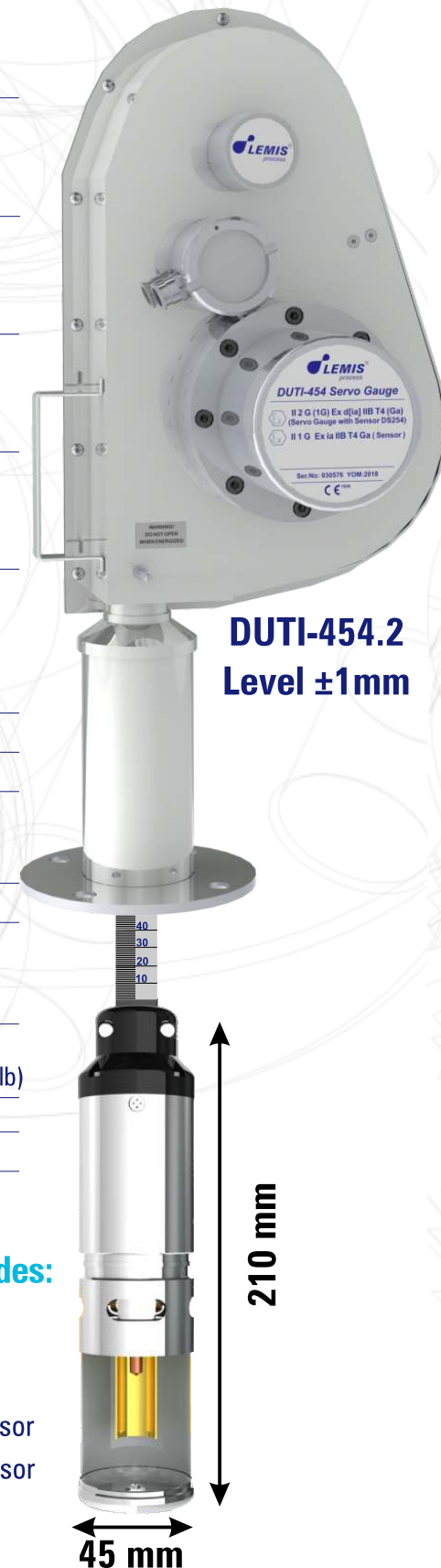
DUTI-454.2 Level ±1mm

For more information please visit www.lemis-usa.com